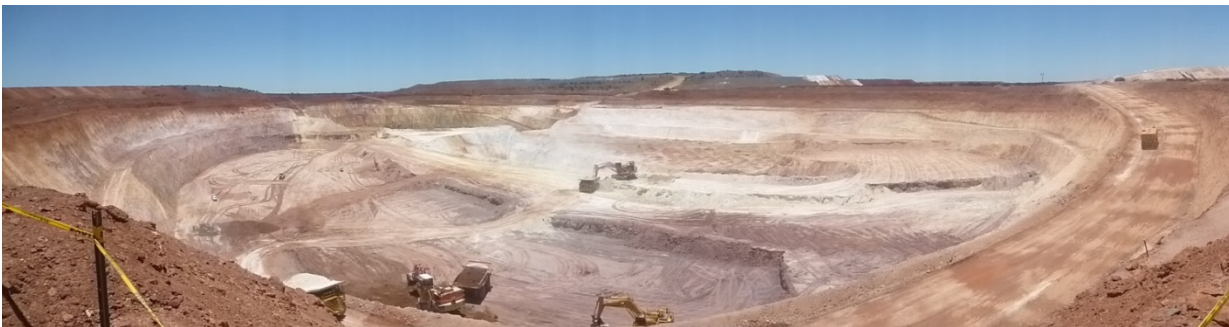
Figure 5 – Thunderbox Open Pit (looking north)

A second excavator (190t) was mobilised to site during October in accordance with the development schedule. This excavator was purchased by Saracen (under a finance lease arrangement) for approximately A$2.5 million. The machine will be maintained by SMS Rentals and operated by Saracen personnel. The excavator commenced mining during November 2015 and had an immediate impact of increasing material movement whilst reducing the unit cost of mining.