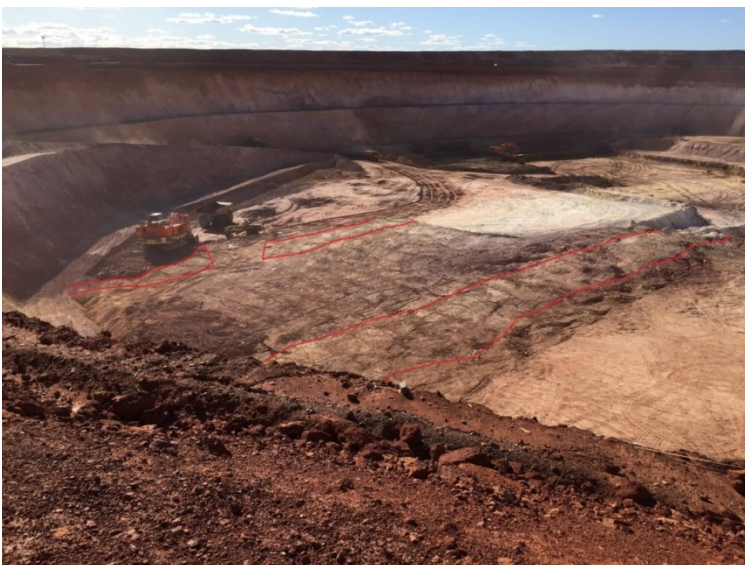
Figure 6 – Thunderbox Open Pit – ‘A’ Zone Ore marked up

Figure 6 clearly identifies the main (wide) footwall lode of high grade ore in the foreground, as well as the smaller hanging wall lodes being faced off by the EX3600 below the pit ramp.