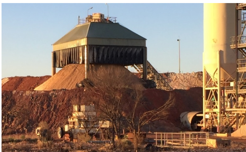
Figure 8 – Crushed ore in the Fine Ore Bin at Thunderbox