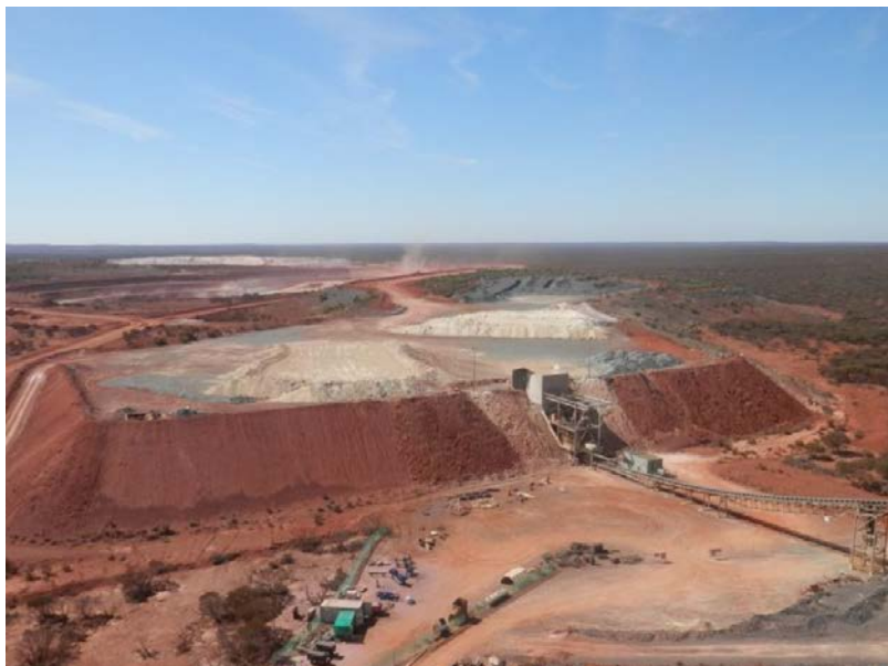
Figure 7 – Ore stockpiles on the ROM pad

As at the 21 st of January, approximately 121,000t of commissioning ore grading 0.9g/t has been stockpiled on the Thunderbox ROM pad (refer Figure 7).